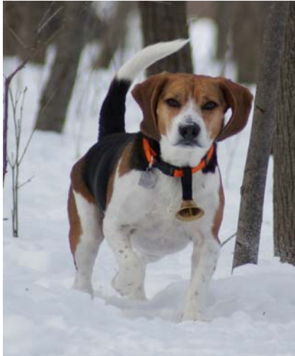
Buddy is ready for winter!