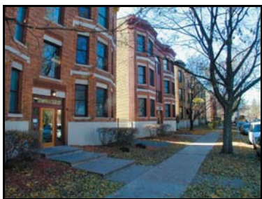
Neighborhood with a pedestrian-oriented design 4