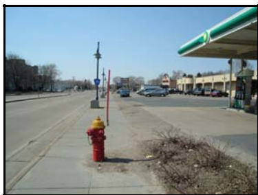
Street with an auto-oriented design