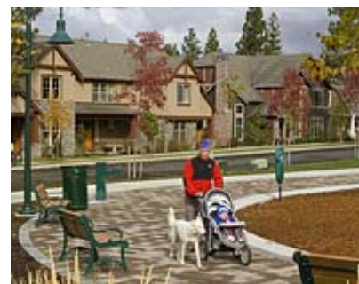
This neighborhood has incorporated various active living principles, including benches, sidewalks, and lighting.

Each section includes a variety of questions related to the topic that can be easily answered and provides a space for comments. The checklist helps to highlight areas where improvement is needed before the plan is finalized. Listed are some of the topics included in the checklist related to active living principles.